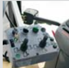
On/Off electric control