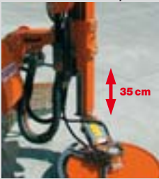
Translation of the vertical upright of the mowing device.