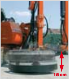
Self-levelling mowing disk system