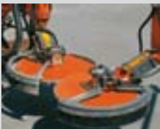
Blade disks with anti-projectile protections

PATENT hydraulic device of the outer arm with stopping device of mowing disk