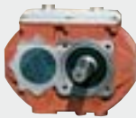
Worm gearbox "HP" high torque transmission