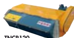
TNCR120 Side toothed belt drive