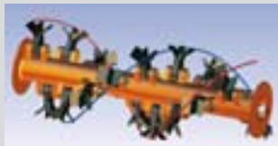
"OVERLAP" spiral rotor with 20 positions