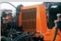
Oil cooler with thermostat