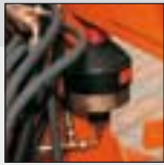
Hydraulic break-back with accumulator controlled autoreset facility