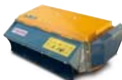
TN120 Direct Drive