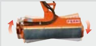
Floating head system