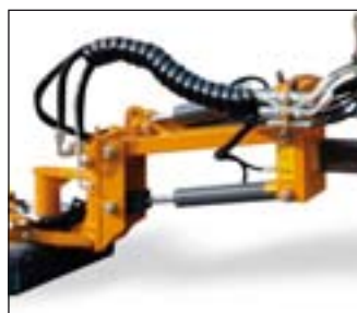
Floating system for self-levelling to the ground