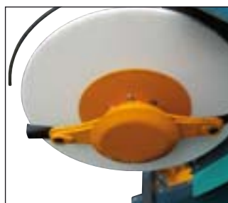
Self ventilated knives