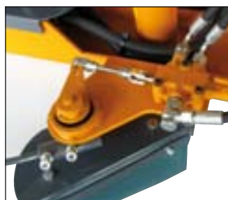
Automatic deviation and return device