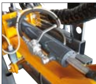
Tap for the hydraulic block during the transport