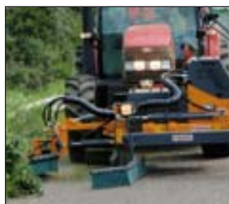
Anti-projectile protections in resistant material